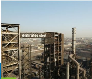
Emirates Steel Division 📍 Abu Dhabi

With global attention focusing on decarbonisation efforts, EMSTEEL is well-positioned to capitalise on the unprecedented demand growth for low carbon steel and sustainable building materials.