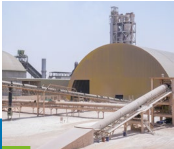
Emirates Cement Division 📍 Al Ain

The Group supplies a range of products within the UAE and has experience in exporting to more than 70 countries, including Europe, America, Asia, Middle East, and North Africa.