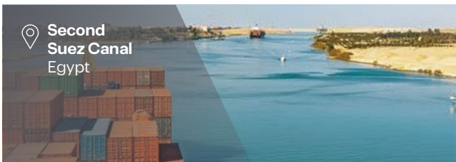
Second Suez Canal Egypt