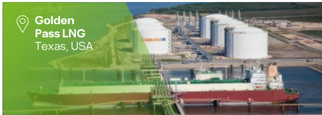
Golden Pass LNG Texas, USA