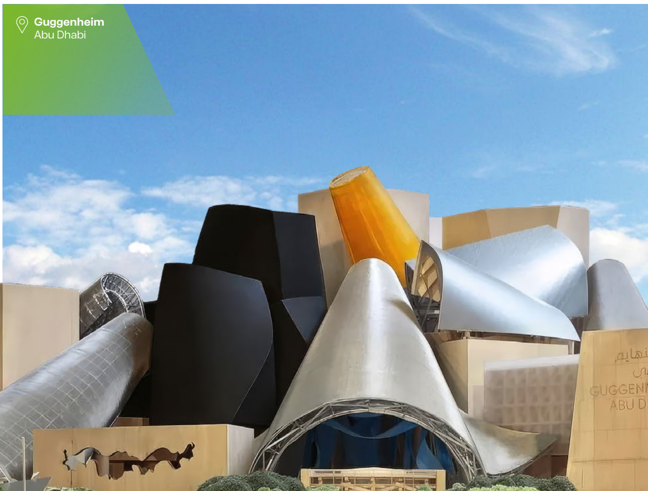
Guggenheim Abu Dhabi