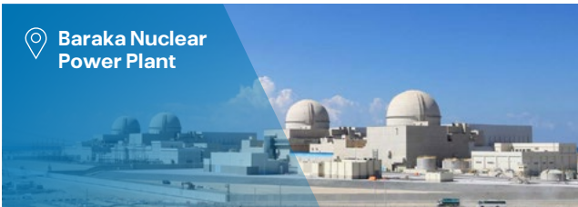
Baraka Nuclear Power Plant