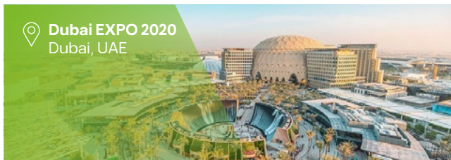
Dubai EXPO 2020 Dubai, UAE