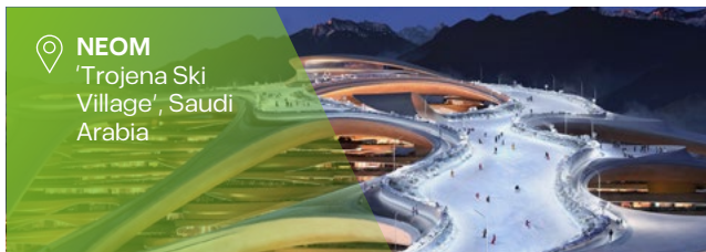
NEOM 'Trojena Ski Village', Saudi Arabia