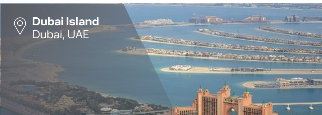
Dubai Island Dubai, UAE