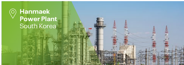
Hanmaek Power Plant South Korea